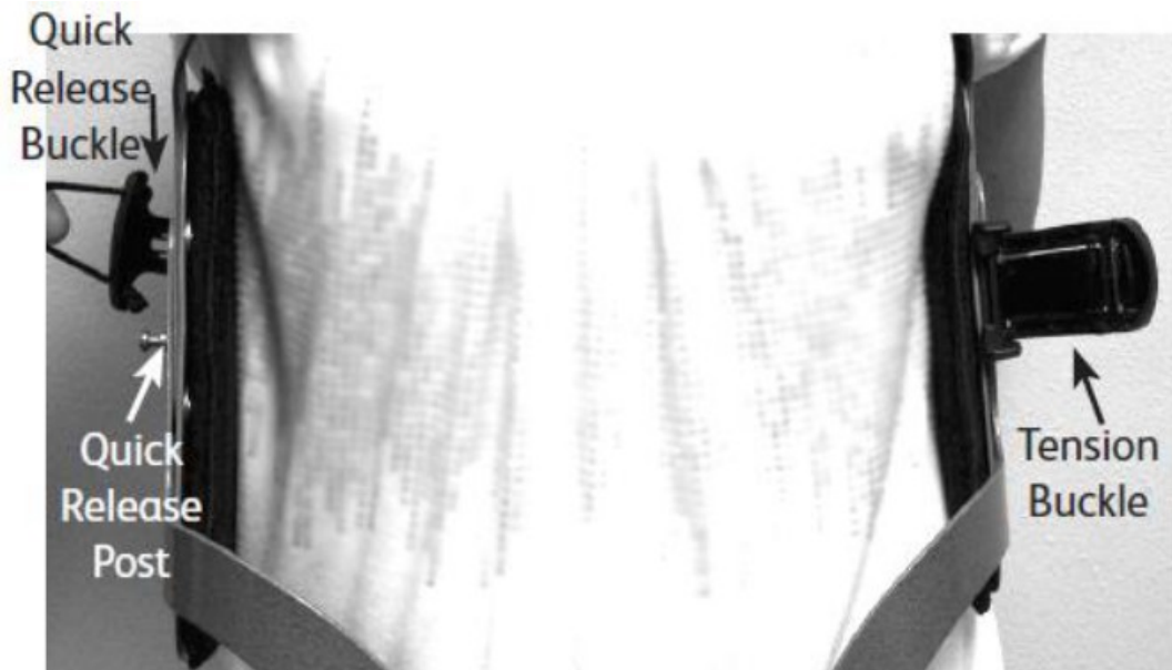
Figure 1: Tension Buckle and Quick Release Buckle